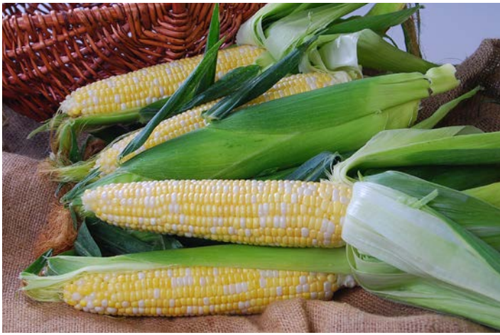
Sweet Corn, Nectar