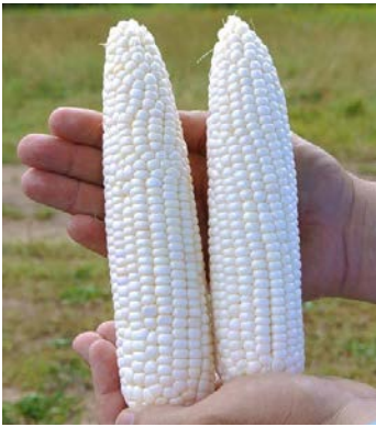
Sweet Corn, Glacial