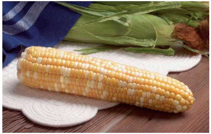
Sweet Corn, Sweet G 90