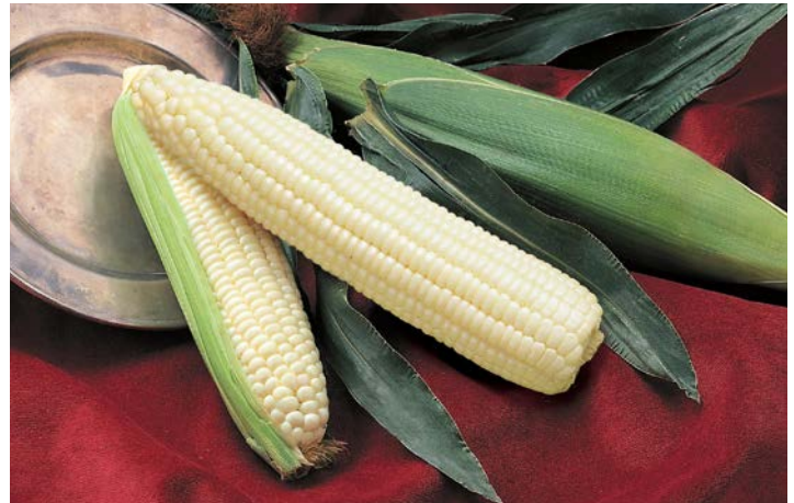
Sweet Corn, Silver Queen