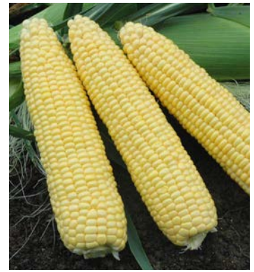
Sweet Corn, Takeoff