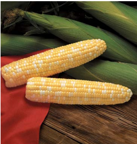
Sweet Corn, Primus