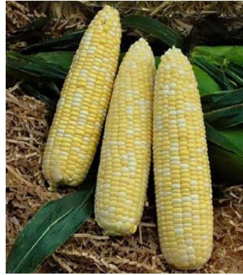
Sweet Corn, Signature XR