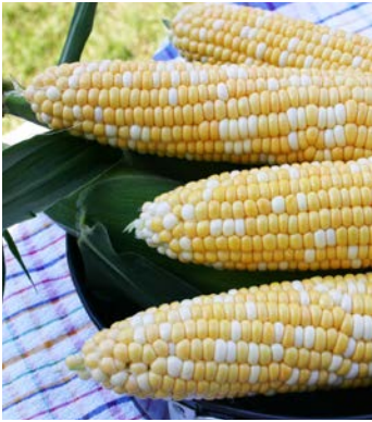
Sweet Corn, Awesome XR