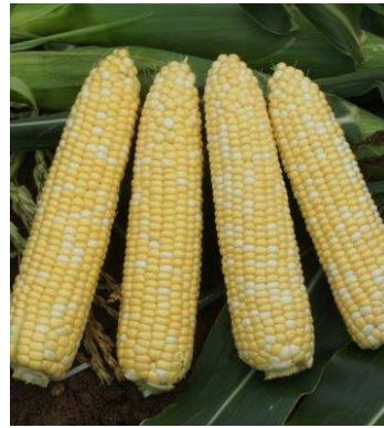
Sweet Corn, Fantastic XR