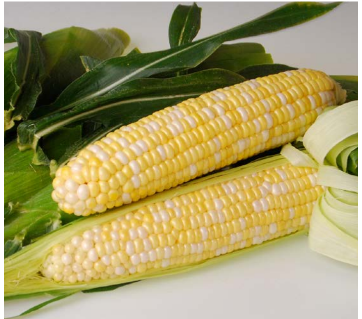
Sweet Corn, Sweetness