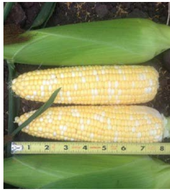
Sweet Corn, Anthem XR