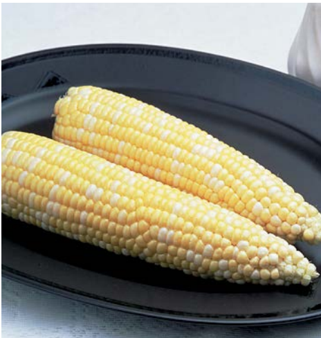
Sweet Corn, Ambrosia