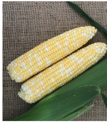
Sweet Corn, Kickoff XR