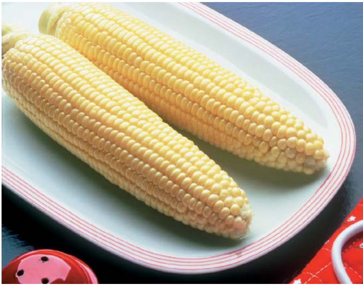
Sweet Corn, Bodacious