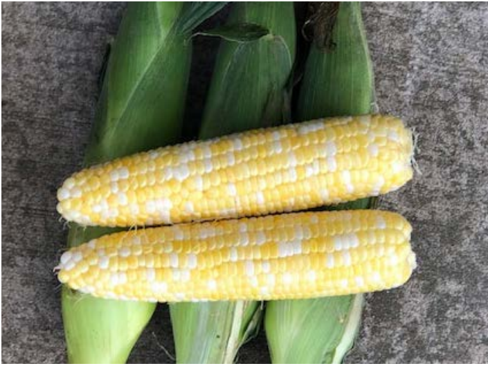
Sweet Corn, Quick Trip