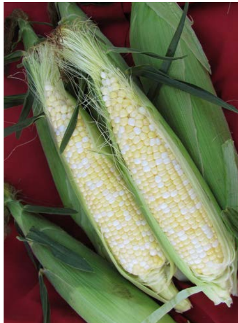
Sweet Corn, SV9014SB