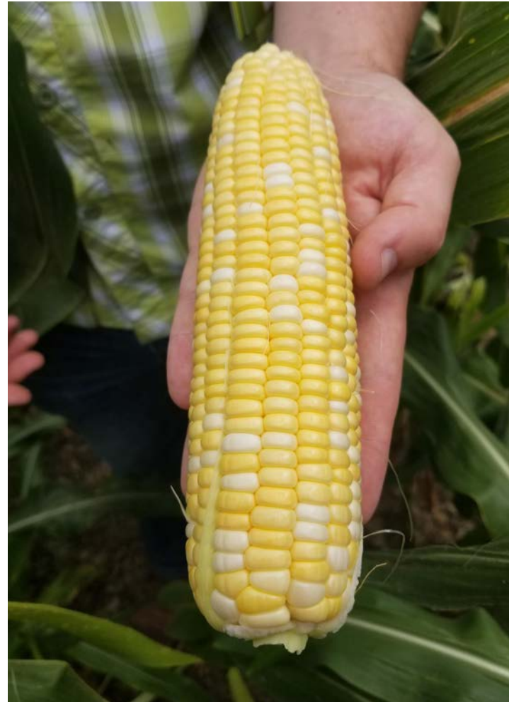
Sweet Corn, Pursuit

The Attribute® II trait stack from Syngenta is the latest breakthrough in above-ground insect protection for sweet corn, delivering unsurpassed control of lepidopteran pests to maximize yield, quality, and productivity. The trait stack includes tolerance to glyphosate and glufosinate herbicides approved for application over the top of Attribute® II sweet corn varieties.