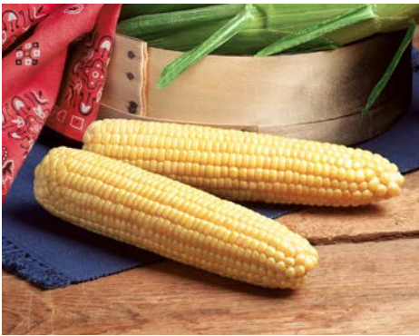
Sweet Corn, Aspire