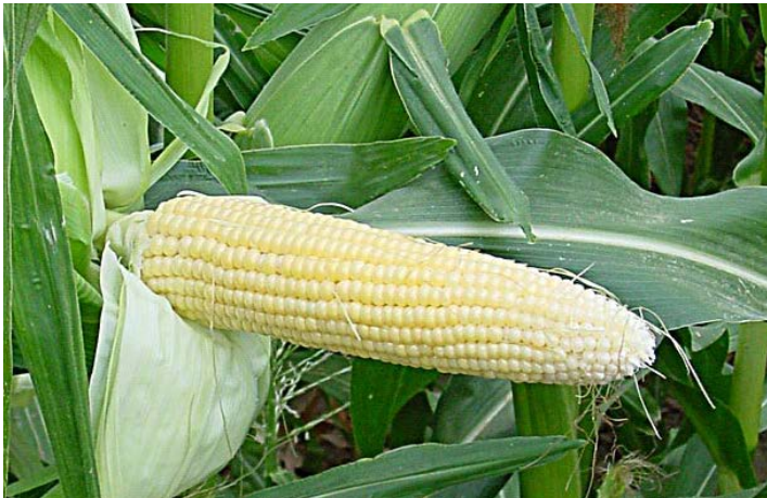
Sweet Corn, NK 199