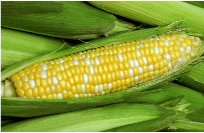
Sweet Corn, Butter and Sugar