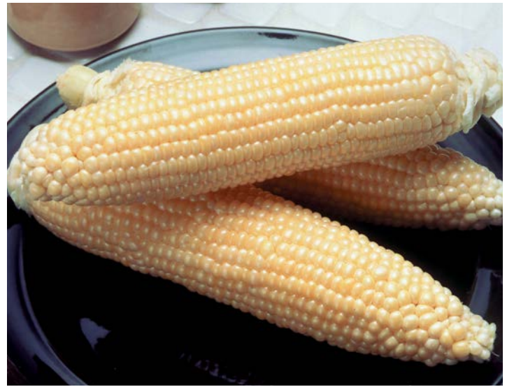
Sweet Corn, Incredible