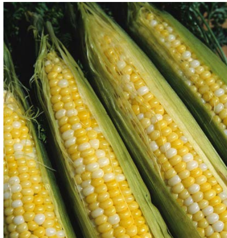
Sweet Corn, Peaches and Cream