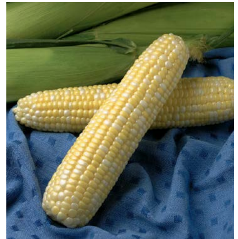
Sweet Corn, Jackpot