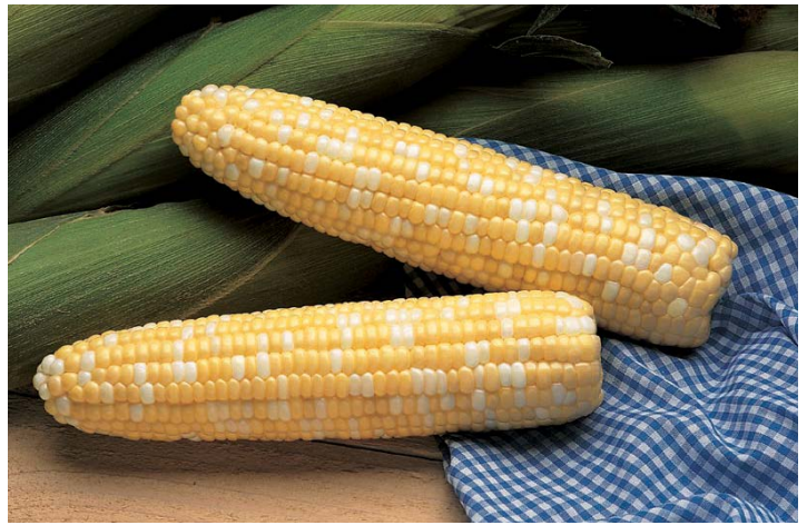
Sweet Corn, Serendipity