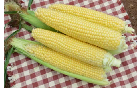
Sweet Corn, SV9012SD