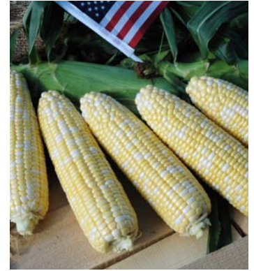
Sweet Corn, American Dream