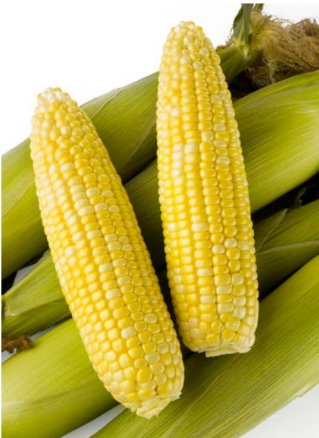
Sweet Corn, Obsession II