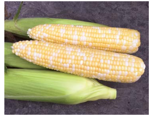
Sweet Corn, Remedy