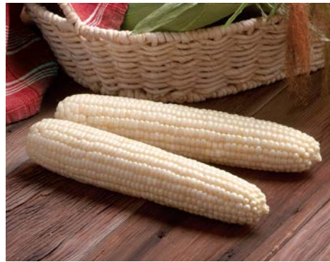
Sweet Corn, Milky Way