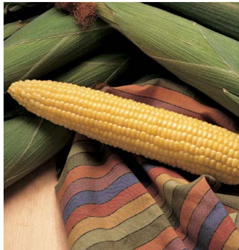
Sweet Corn, Honey Select