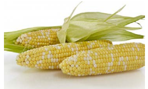
Sweet Corn, Temptation II