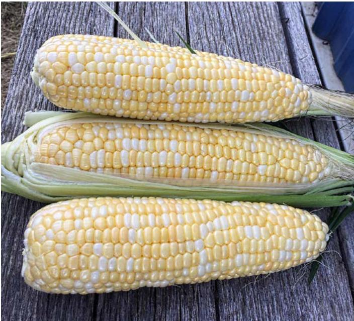
Sweet Corn, Big N Tender