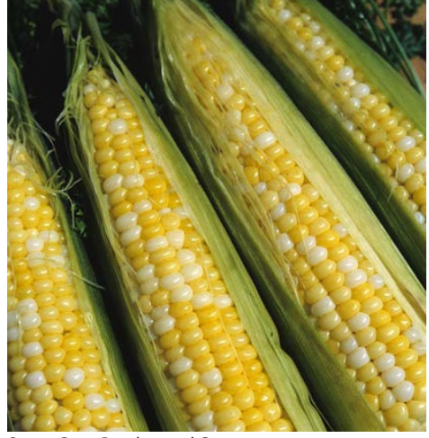
Sweet Corn, Peaches and Cream