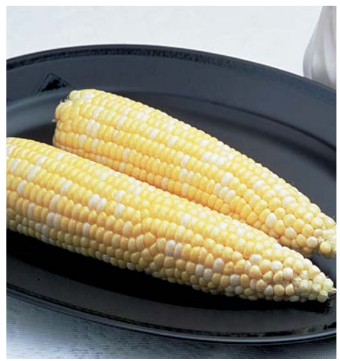
Sweet Corn, Ambrosia