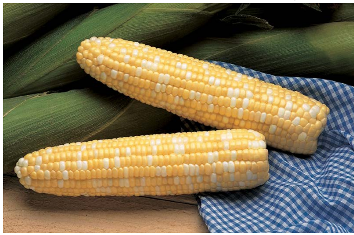
Sweet Corn, Serendipity