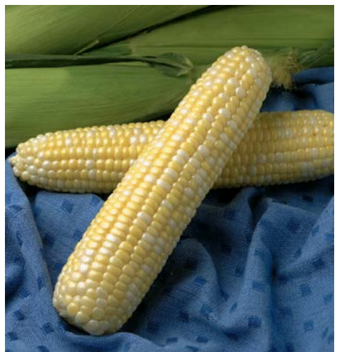
Sweet Corn, Jackpot