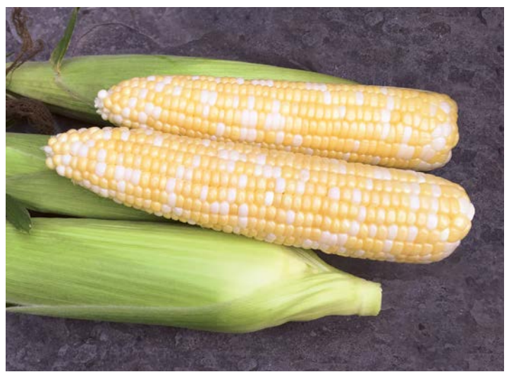
Sweet Corn, Remedy