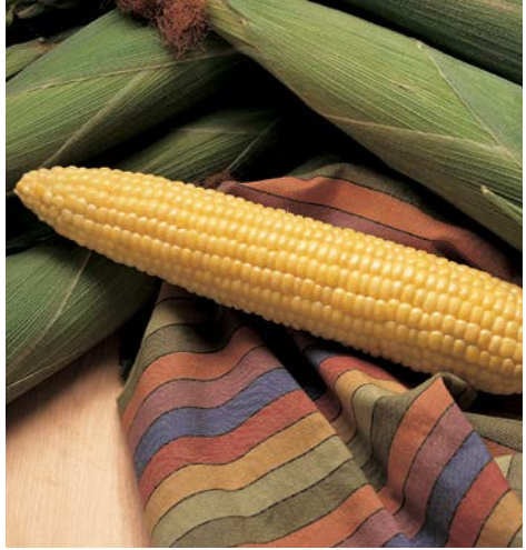
Sweet Corn, Honey Select