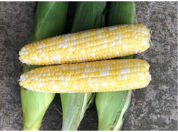
Sweet Corn, Quick Trip

The introduction of the Attribute<sup>®</sup> II trait stack continues the Syngenta tradition of providing high-performance traits to sweet corn growers, and now it has the added power of Vip3A — a unique mode of action proprietary to Syngenta. The combination of Vip3A with Cry1AB, the protein found in Attribute<sup>®</sup> insect-protected sweet corn varieties, offers excellent control of key yield-robbing insects including European corn borer, corn earworm, and fall armyworm. Attribute<sup>®</sup> II is also highly effective against Western bean cutworm, which has emerged as a serious and growing threat in many production areas.