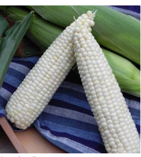
Sweet Corn, Illusion