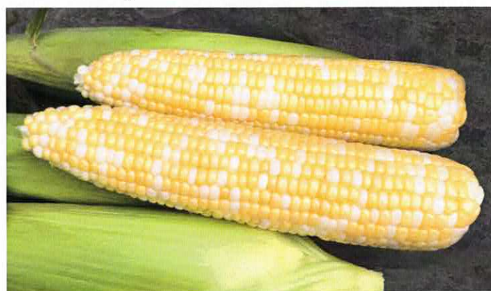
Sweet Corn, Remedy