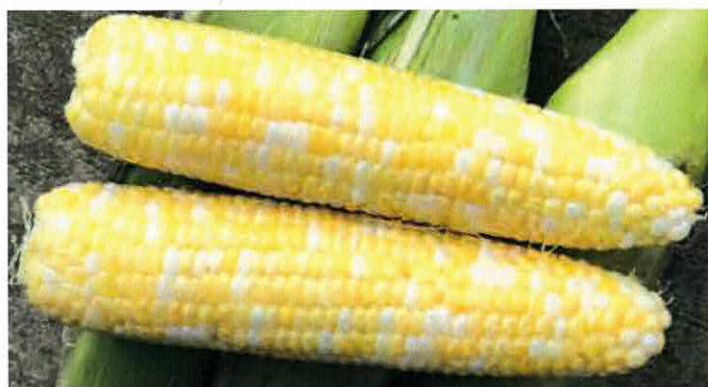
Sweet Corn, Quick Trip

The introduction of the Attribute® II trait stack continues the Syngenta tradition of providing high-performance traits to sweet corn growers, and now it has the added power of Vip3A — a unique mode of action proprietary to Syngenta. The combination of Vip3A with Cry1AB, the protein found in Attribute® insect-protected sweet corn varieties, offers excellent control of key yield-robbing insects including European corn borer, corn earworm, and fall armyworm. Attribute® II is also highly effective against Western bean cutworm, which has emerged as a serious and growing threat in many production areas.